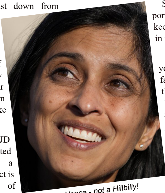
Usha Vance - not a Hillbilly!