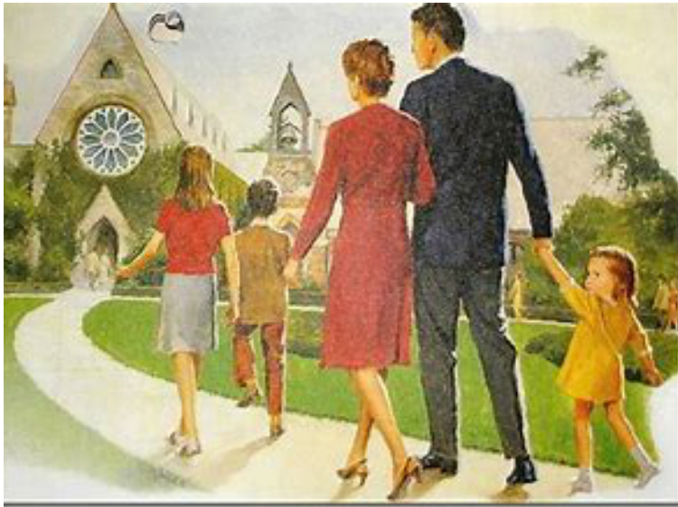
It was White Christian families that made America great!

Let's look at this important verse because it reveals the shortcomings of the MEGA movement.