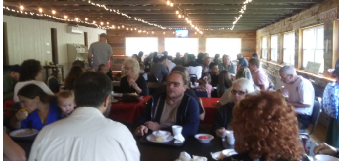
The dining hall is filled with hungry people. Others are eating out on the patio.