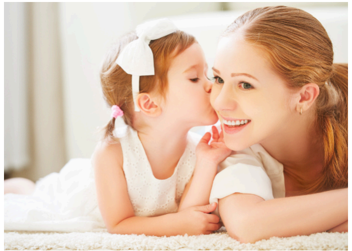
Mother with her baby girl. To the Democrats - this is weird!