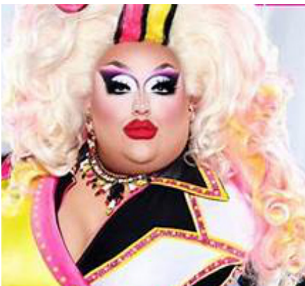
Harris and Walz supporters Not Weird - Just freaks!

According to them, you are weird, too, because you believe old-style values are a good thing.