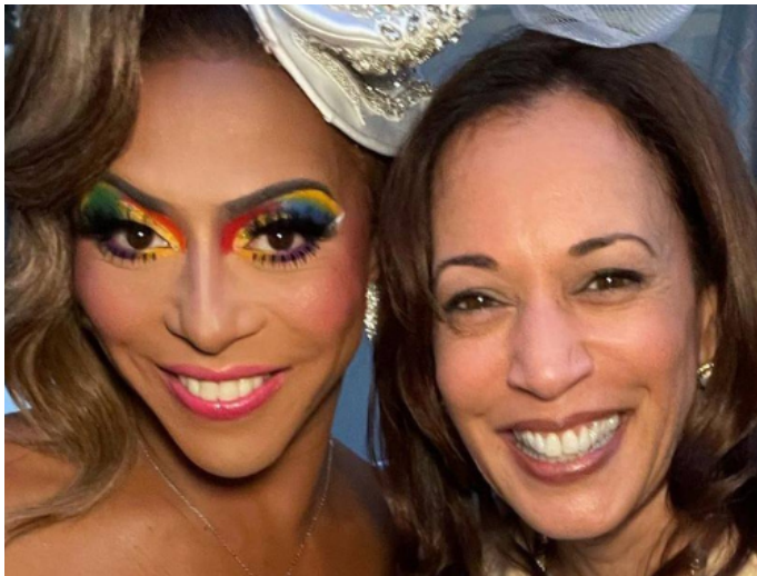
Kamala Harris with Drag Queen. To the Democrats - this is normal.