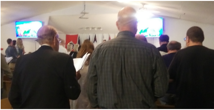
Attendees at the recent Knights Party Conference held over the week-end of Aug 30-Sept 1 at the Soldiers of the Cross Bible Camp.