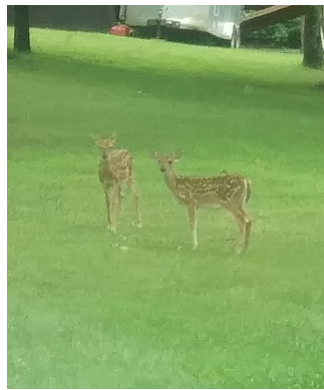
Baby deer are seen here grazing in the pasture in front of the Christian Revival Center.