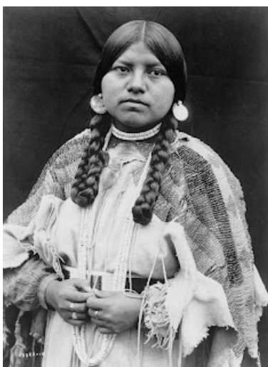
The Indian "princess" of reality!