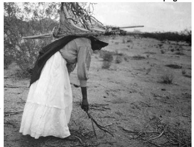
American Indian woman gathering wood off the ground for a fire. This is commonly called “squaw wood.”