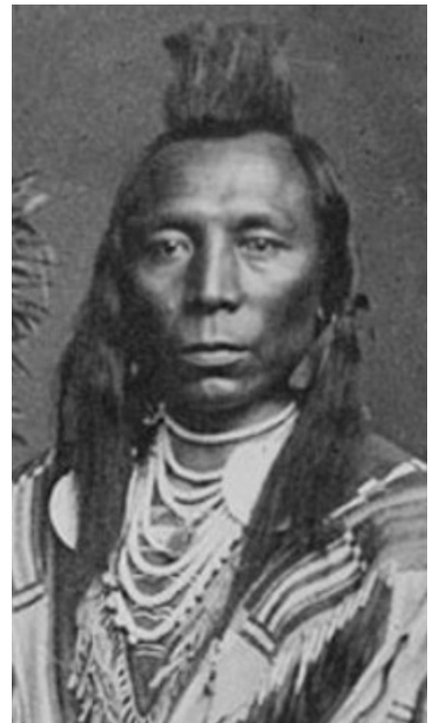
American Indians, like the one shown above, were a threat to European settlers throughout the United States and its western territories.

While there were exceptions, American Indians were considered a threat to European Christians. All but a hand-full of states enacted laws prohibiting marriages between whites and nonwhites - which usually included Indians. However, white Christians, on their own, generally rejected the abomination of interracial marriages between whites and non whites