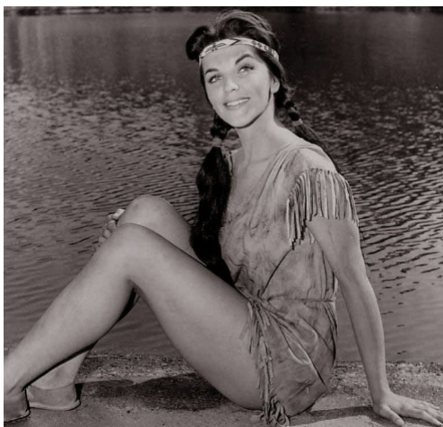
The Indian "princess" of fantasy.

real Indian grandmother is probably the nicest thing that could happen to a child, why is a remote Indian princess grandmother so necessary for many whites? Is it because they are afraid of being classed as foreigners? Do they need some blood tie with the frontier and its dangers in order to experience what it means to be an American? Or is it an attempt to avoid facing the guilt they bear for the treatment of the Indians?"