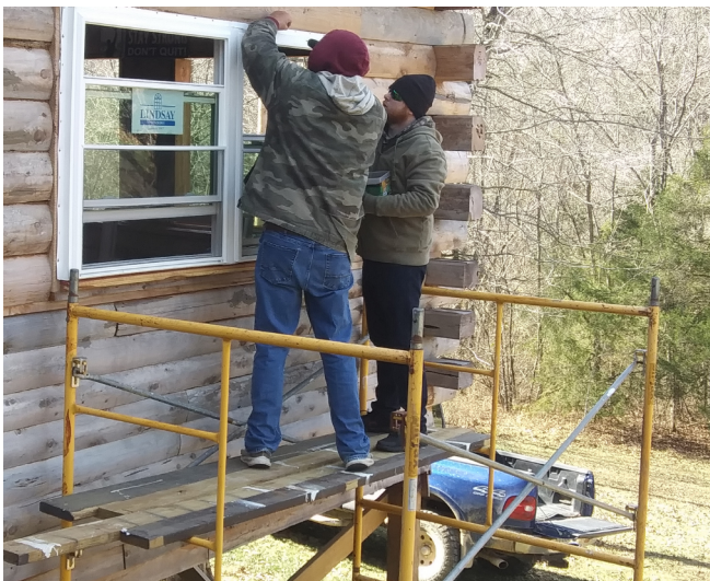
Windows being installed in dinning hall

The Christian Revival Center's new dinning hall is progressing nicely. By the time you receive this in the mail all the windows will be installed. Of course with the cold days of winter at our front door, having these windows is extremely important.