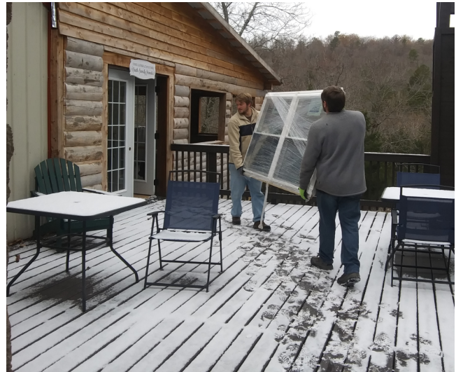
Windows being carried in