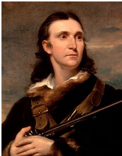
John James Audubon - "racist!"

The New York Audubon society, the nations largest is changing its name. The new name will be NYC Bird Alliance. The reason for the name change is because they want to separate themselves from the racism of its namesake. The society was named after ornithologist and illustrator John James Audubon (1785 – 1851) who between 1827-1839 compiled The Birds of America depicting birds in their natural habitats. The Birds of America, is considered one of the finest ornithological works ever completed.