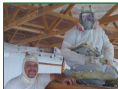
Preparing to spray foam insulation on ceiling