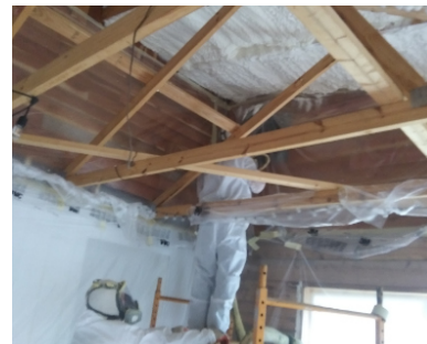
Spraying foam insulation on ceiling