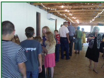
Pot luck Sunday at the Christian Revival Center