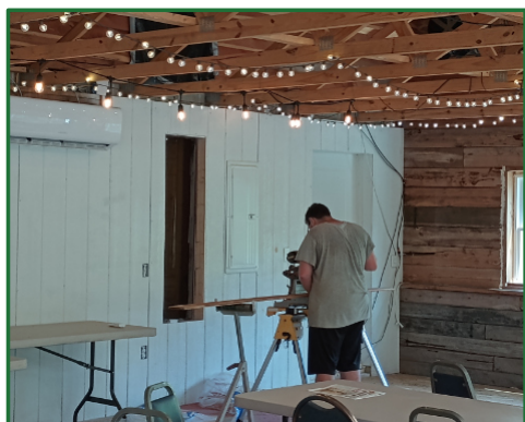
Cedar boards being cut to go along the wall between the rafters. See below.