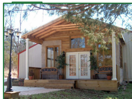
Front entrance to the Christian Revival Center