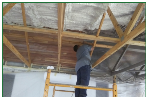
Applying paint to the foam insulation