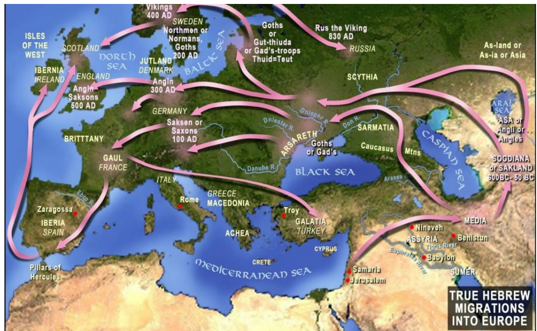
This map shows the migrations of Israel from Palestine into Europe. Because of their sin God scattered Israel from out of heir homeland. James opens his epistle to the twelve tribes "scattered abroad."