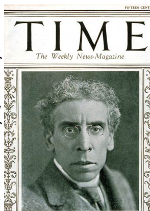
Zangwill honored by Time Magazine - 1923