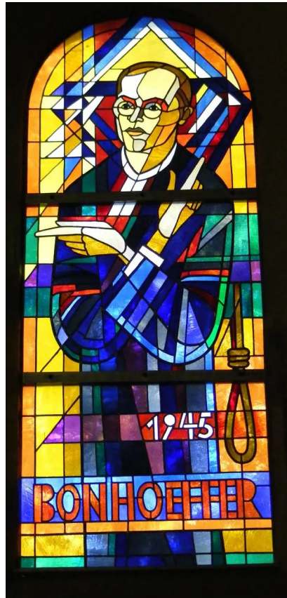
Saint Dietrich in stain glass at Basilica of St. John the Baptist in Berlin.